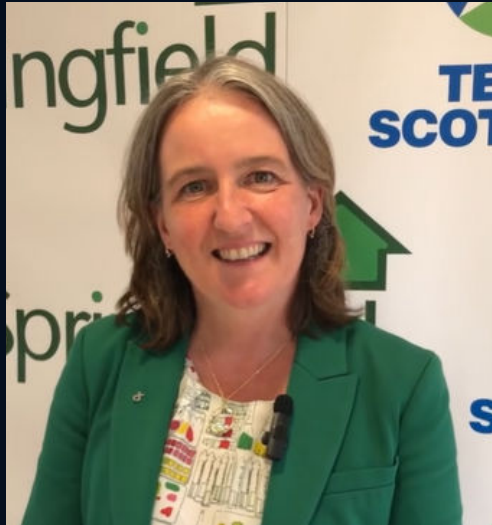
Maree Todd, MSP Minister for Social Care, Mental Wellbeing & Sport Click here to watch